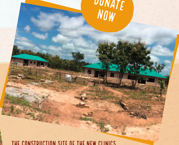
THE CONSTRUCTION SITE OF THE NEW CLINICS IN TAINSO (TOP) AND TANOKROM (LEFT)