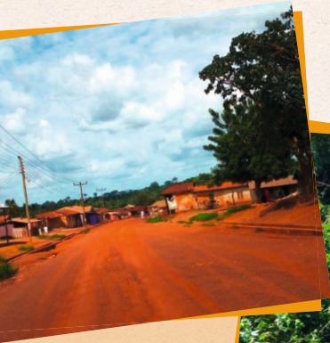
RIGHT: THE VILLAGE OF KOR KYIKROM BOTTOM: THE WATER HOLE IN KOR KYIKROM