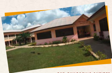
OUR CHILDREN'S SHELTER

COSTS: € 50 PER MONTH FOR A SPONSORSHIP € 30 FOR A SET OF CLOTHES AND SHOES