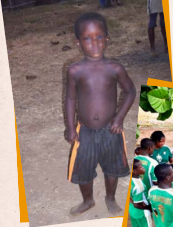
LEFT: TRAFFICKED CHILD AT LAKE VOLTA RIGHT: RESCUED CHILDREN IN OUR CHILDREN'S SHELTER