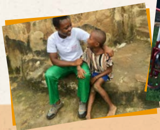
OUR PROJECT COORDINATOR MEETS THE CHILDREN ON SITE