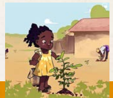
FROM OUR CAMPAIGN VIDEO