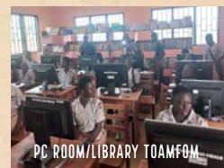
PC ROOM/LIBRARY TOAMFOM