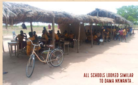
ALL SCHOOLS LOOKED SIMILAR TO DAMA NKWANTA.