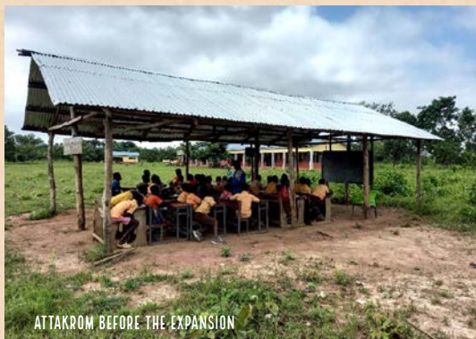
ATTAKROM BEFORE THE EXPANSION

Construction work has already commenced on both schools, and we anticipate that the new facilities will be made available to the children later this year.