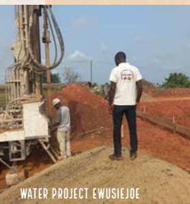
WATER PROJECT EWUSIEJOE