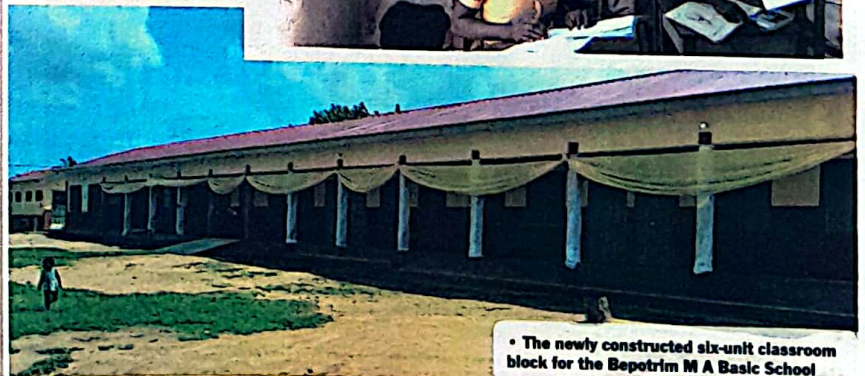
• The newly constructed six-unit classroom block for the Bepotrim M A Basic School