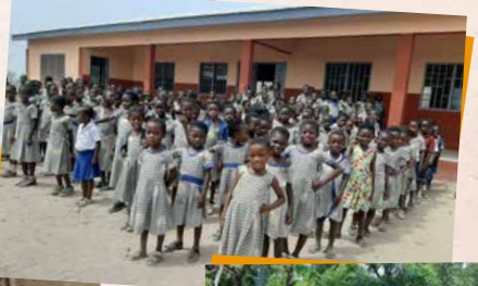
ABREASE ELEMENTARY SCHOOL – AFTER