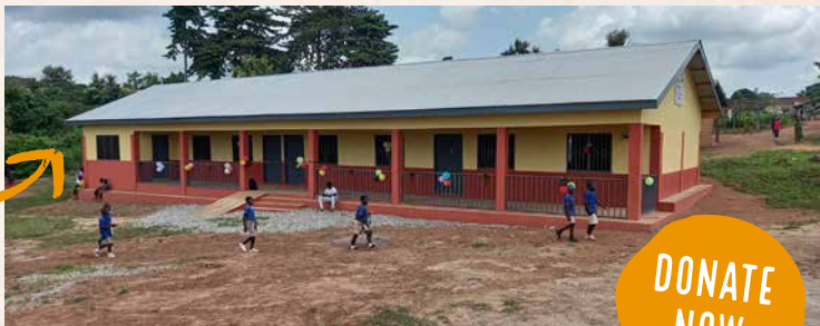
KINDERGARTEN MORLE - AFTER