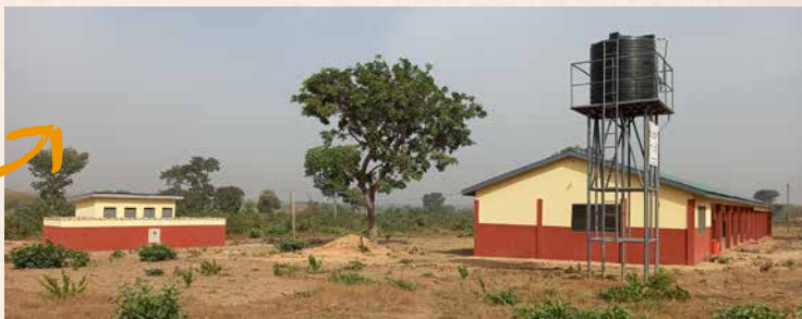
DAMA NKWANTA - AFTER