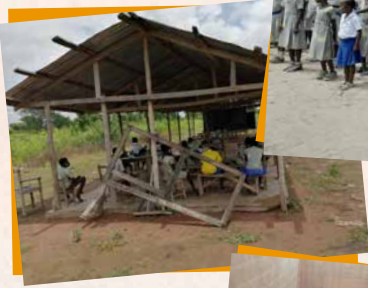
ABREASE ELEMENTARY SCHOOL – BEVOR