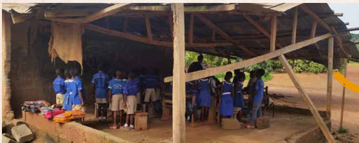
KINDERGARTEN MORLE – BEVOR