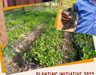
PLANTING INITIATIVE 2022