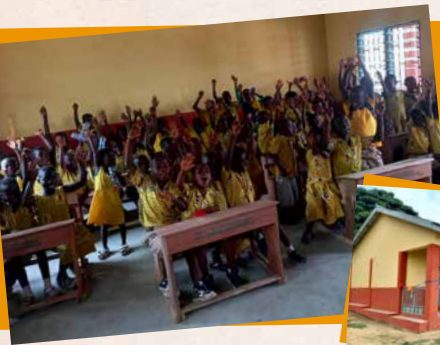
KINDERGARTEN ESSAASE LAKESIDE - BEFORE

Education is the key to a self-determined life and we will therefor continue to focus our work on educational projects. Currently, 8 additional school-construction- and WaSH projects are underway and many more are already planned.