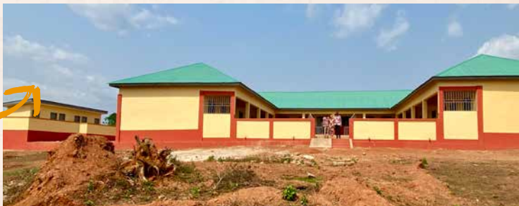
AMPAHA - AFTER