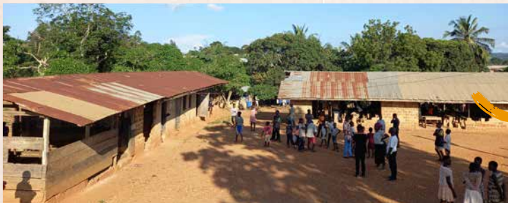
AMPAHA – BEVOR