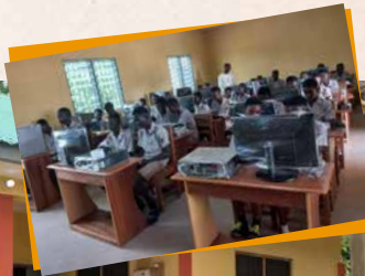
ICT-ROOM APEWU LAKESIDE – INSIDE AND OUTSIDE