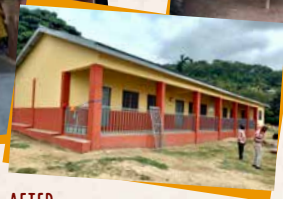
KINDERGARTEN ESSAASE LAKESIDE - AFTER