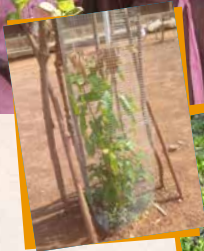
SAPLINGS FROM JUNE 2021