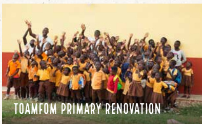
TOAMFOM PRIMARY RENOVATION