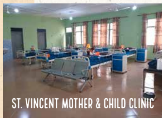
ST. VINCENT MOTHER & CHILD CLINIC