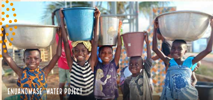
ENUANOMASE WATER PROJECT