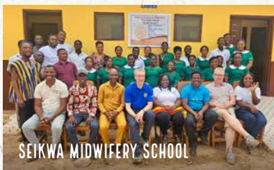
SEIKWA MIDWIFERY SCHOOL